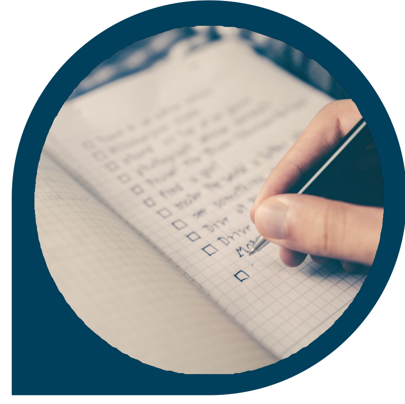
Workshop 2 Compliance Across Borders: Trusted Research, NSPM-33 & Export Compliance

Workshop 3 International Subawards Part I: Negotiation & Compliance